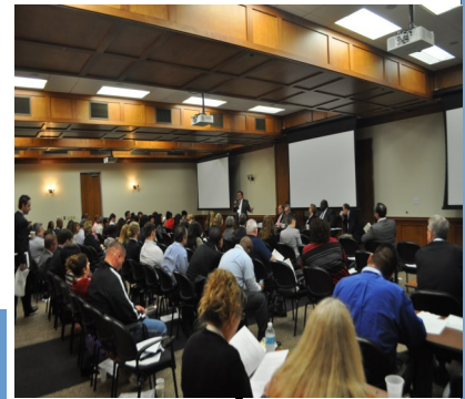
The first TAPS Conference had a great turnout.